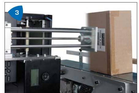
3 Versatile, applying labels from the top, bottom or sides in any rotation.