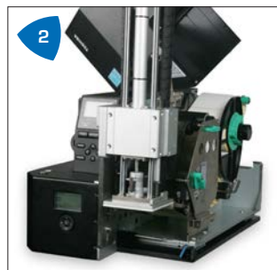
2 Compact, secure and easy to access for the operator.